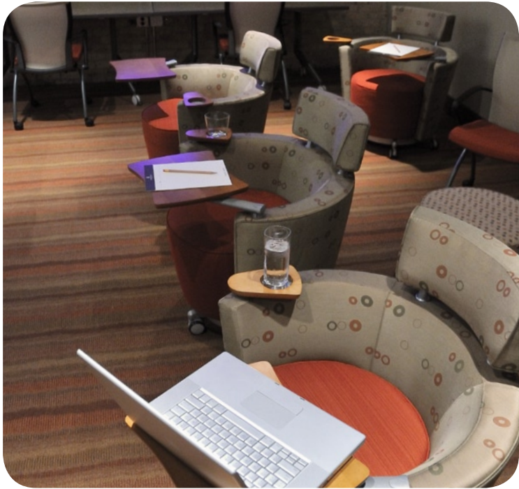
DIMENSIONS (SAND BOX & WAR ROOM)

406 SQ FT (29' x 14') EACH 10' CEILING HEIGHT